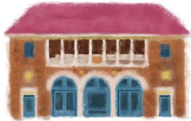
A Friend to the Redwood City Public Library