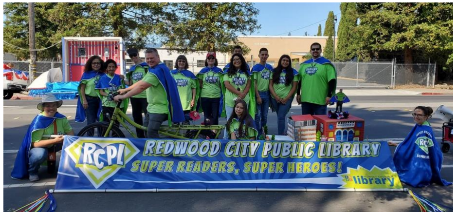
July 4 Parade – Library and Friends Super Readers, Super Heroes Mini-Library Float by Casa Círculo Cultural

All storytimes are sponsored by the Friends.