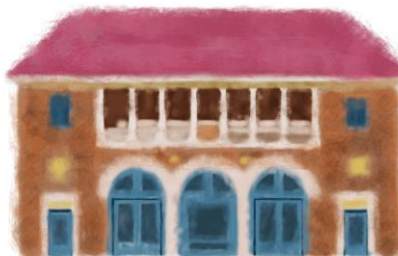
A Friend to the Redwood City Public Library