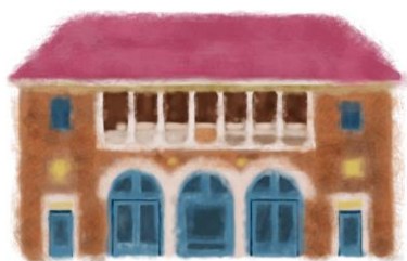
A Friend to the Redwood City Public Library